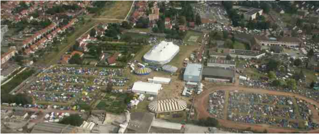
Carvin EJC 2004.Attendance:4,500 Jugglers